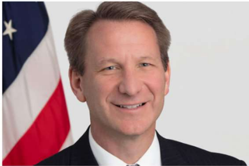
Featuring a fireside chat with National Cancer Institute (NCI) Director Dr. Ned Sharpless